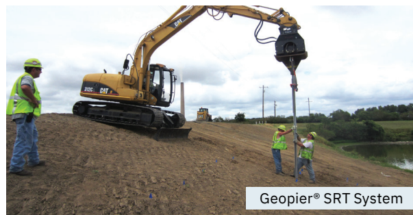
Geopier® SRT System