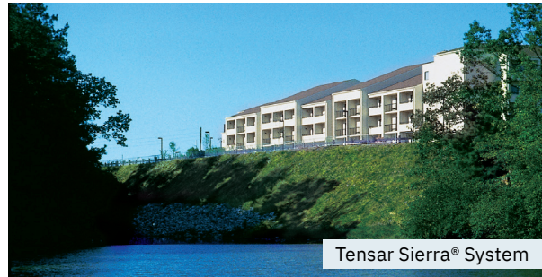
Tensar Sierra® System

Both Sierra Slope and SRT systems are proven world-wide, tolerating extreme conditions, differential settlement and seismic events. They also blend naturally with the surrounding environment without the need for concrete facades.