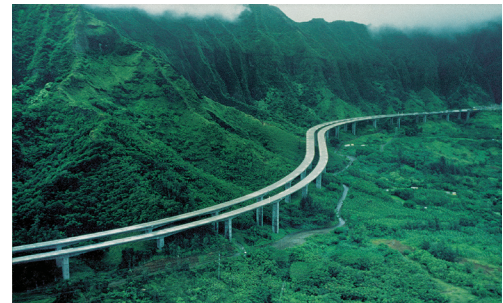
Interstate H-3, Oahu, Hawaii: ASCE recognized this Sierra System project with the Outstanding Civil Engineering Achievement Award.