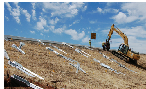
Williams, California: Stabilizing 1.5 miles of embankment slopes for Caltrans using Geopier® Plate Piles™ elements.

The Tensar Corporation is a premier provider of technology driven site solutions based on advanced soil stabilization technologies that incorporate high performance, patented products. The benefits of combining two or more of our company's products, services, applications and/or systems result in faster, stronger and more economical solutions that save time and money when compared to conventional alternatives. Tensar also offers customized, engineering-based solutions that address a wide range of site development challenges.