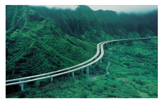
Interstate H-3, Oahu, Hawaii: ASCE recognized this Sierra System project with the Outstanding Civil Engineering Achievement Award.