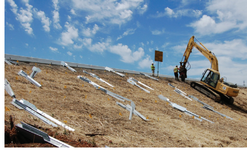
Williams, California: Stabilizing 1.5 miles of embankment slopes for Caltrans using Geopier® Plate Piles™ elements.

Whether you are an engineer, contractor, or owner - We can help.