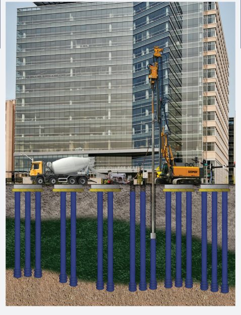
RIGID INCLUSION (RI) High stiffness elements constructed of cement, aggregate/grout mixture, or cement-treated aggregate