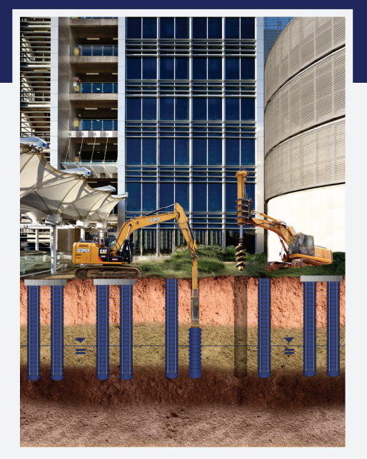
RAMMED AGGREGATE PIER® (RAP) Direct vertical ramming energy that provides superior support capacity, increased bearing pressure (up to 10,000 psf), and superior settlement control